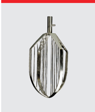
Wing whip, stainless steel