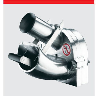
Vegetable cutter GR20