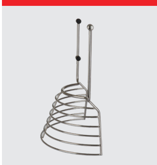
Stainless steel grid guard. Not CE-certified