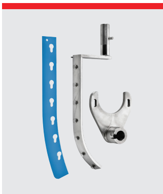
Automatic scraper, stainless steel. 40L and 40/20L.