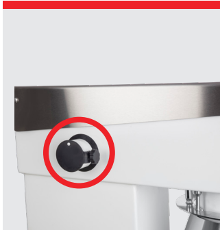
Attachment drive for meat mincer and vegetable cutter