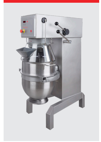
Marine version, stainless steel