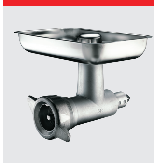
Meat mincer, 82 mm