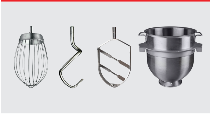
Whip, hook, beater and bowl 40 liter in stainless steel.