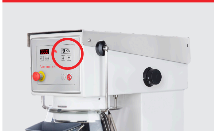
VL-1S – Automatic speed regulation and automatic bowl lowering