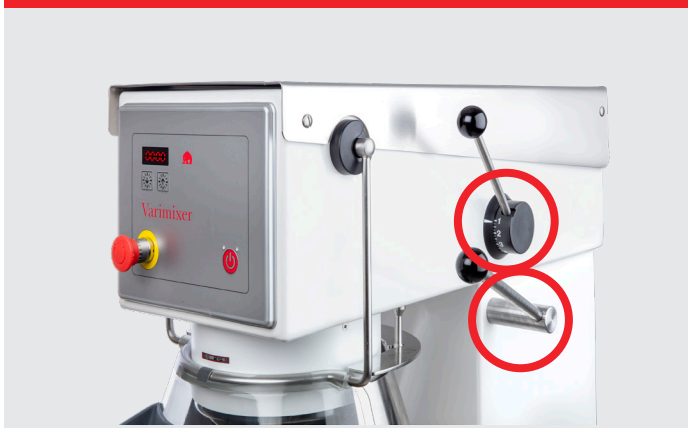
VL-1 – Manual speed regulation and manual bowl lowering