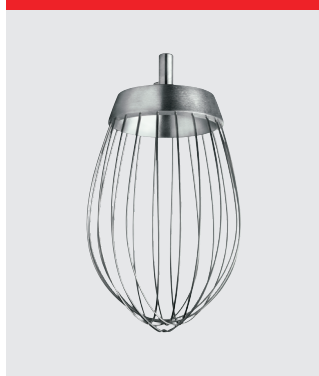
Whip with thinner wires, stainless steel