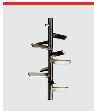
Powder mixer, stainless steel