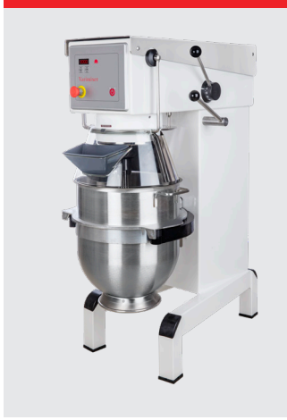
White, powder coated