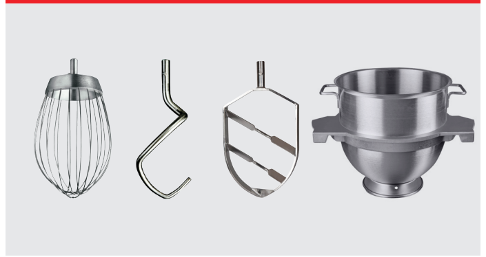
Whip, hook, beater and bowl 40/20 liter in stainless steel.