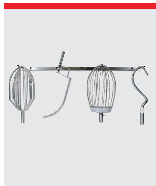
Tool rack, 91 cm